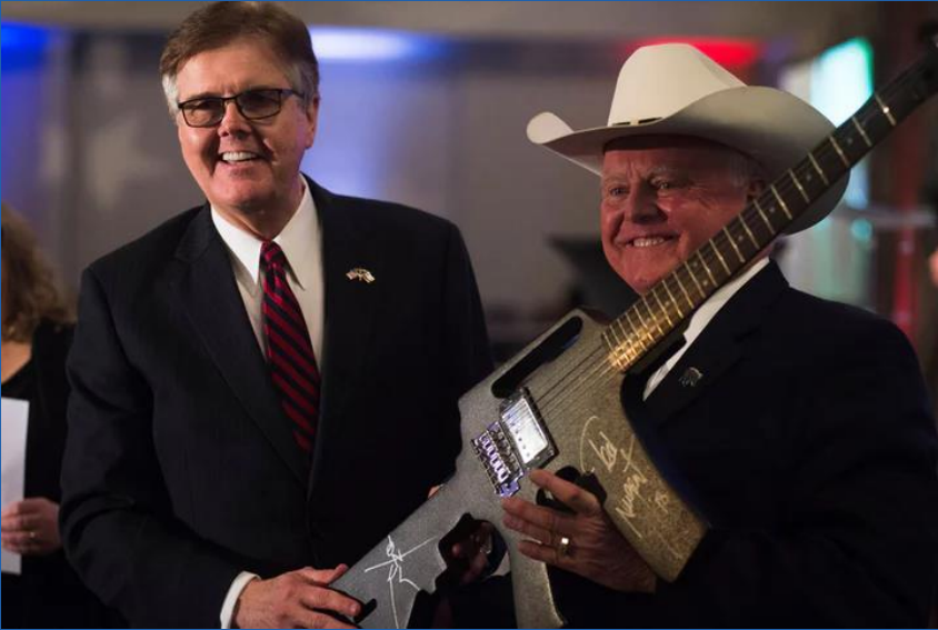
Lt. Gov. Dan Patrick