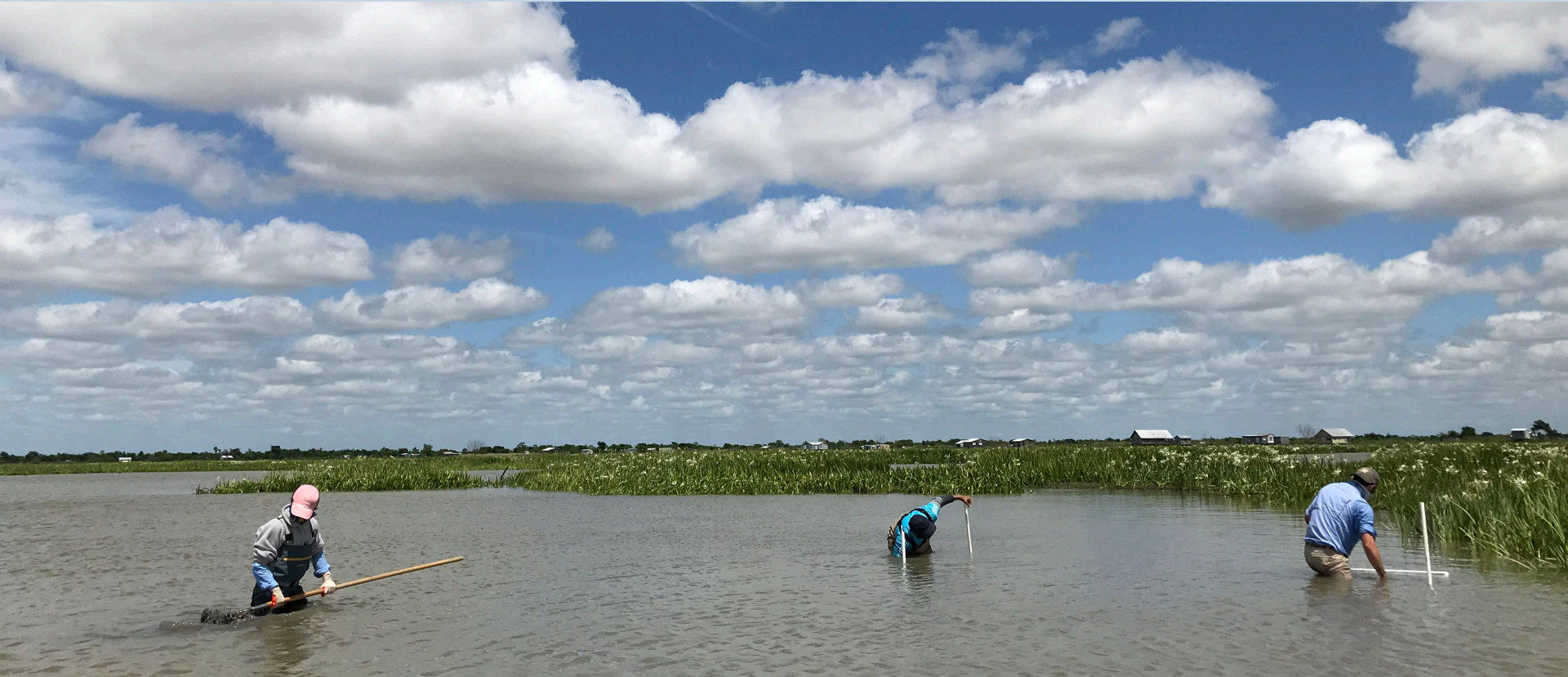
Sampling for Rangia clams in Trinity Bay