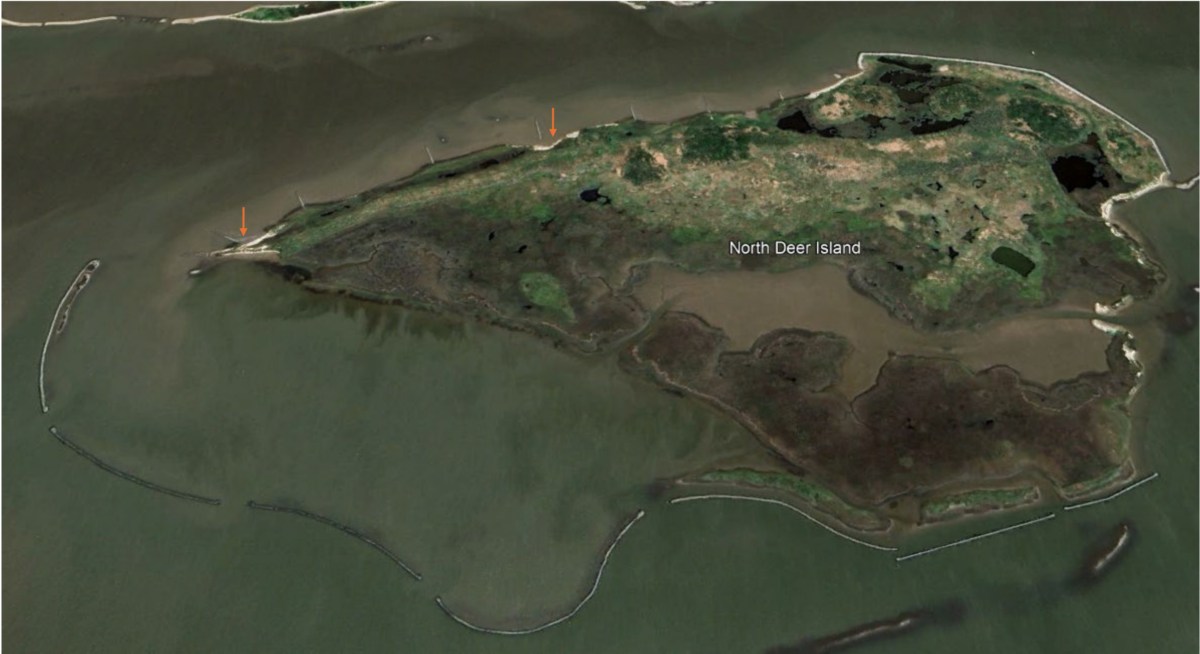
North Deer Island